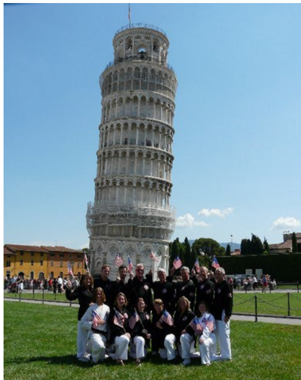
This historic group picture was taken in front of Leaning Tower in Pisa.