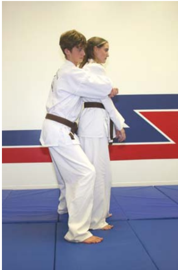
The Bear Hug.