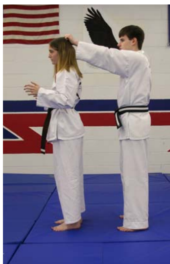
The hair grab from behind.

The following are few of the situations that are presented in the program: