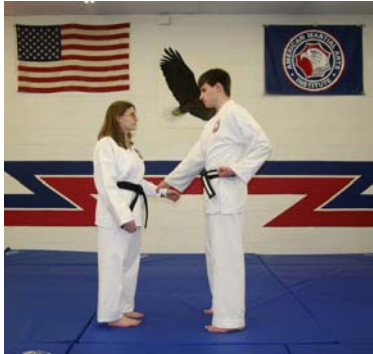
1) The Straight Across Wrist Grab