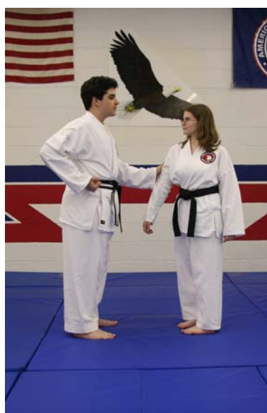
The Sleeve Grab