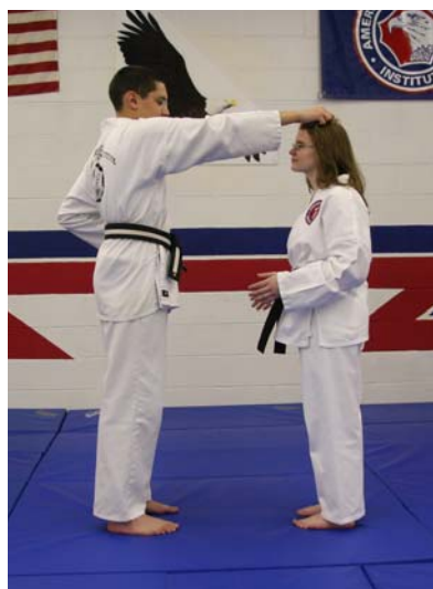
The hair grab from the front.