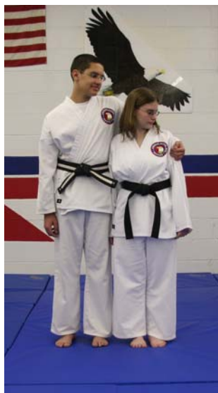
Arm around the shoulder.