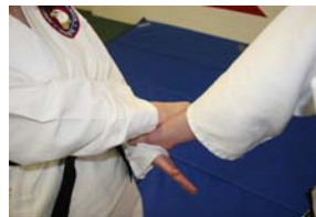
Close-up of the impact.

Close your right hand into a proper fist and raise it to your left shoulder. Step back with your left foot, moving away from the attacker's arm that has grabbed you. Slide your right arm down your left arm as hard as you can, striking the assailant's wrist, and simultaneously pull your left arm back. At this point, you have two choices. You can flee from the area and get help, or you can follow this freeing motion with a counterstrike to the attacker.