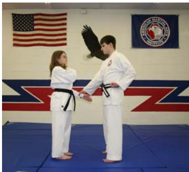
2) Bring your right arm to your left shoulder.