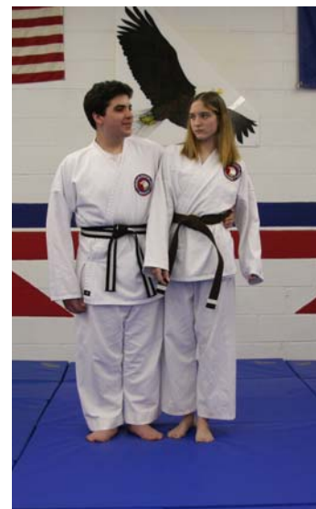
Arm around the waist.