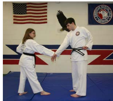
4) You are free to escape.