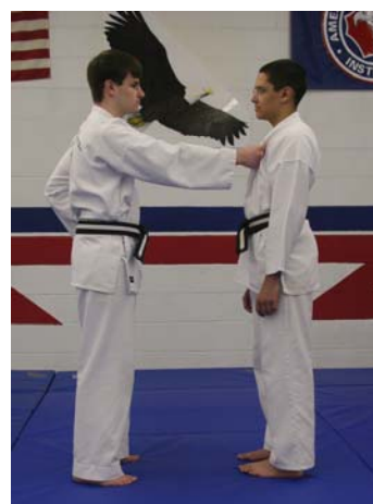
A single lapel grab.