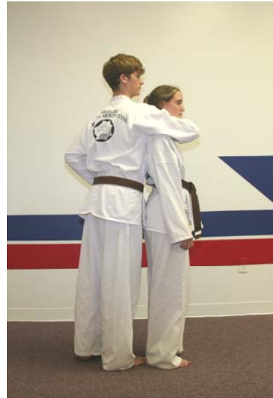
Choke hold from behind.